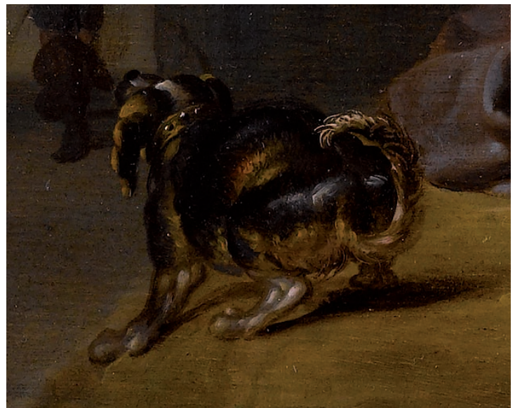
Maerten Stoop, A Card Game in a Courtyard (Detail)

A Card Game in a Courtyard presents a scene in which a conspicuously well dressed woman plays a game of cards with two soldiers in a courtyard. The figures are bathed in an intensely bright light, in contrast to their surroundings, which reflects off the woman's white dress and pale skin. The company are assembled in a makeshift fashion, seated around a drum instead of a card table, and strewn about them, amongst the dirt and hay of the ground, are garments and pieces of armour that have been casually cast aside. They sit on a platform raised above the rest of the courtyard floor, on the edge of which a small dog stands alert. He faces towards a large archway on the left, through which a soldier in a brown cloak, plumed hat, blue breeches and floppy boots pensively strolls. His face is downcast in shadow and he is seemingly oblivious to the rollicking entertainment being had by