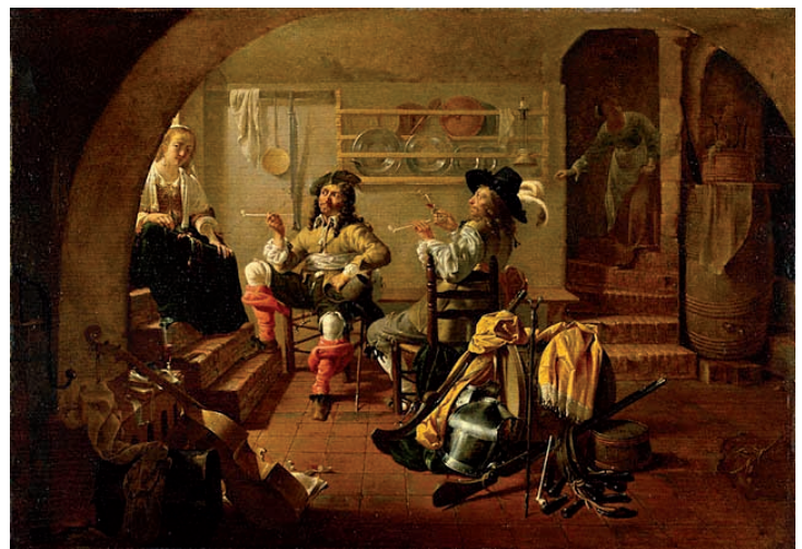
Jacob Duck, Interior with Soldiers and Women , c.1650, the J. Paul Getty Museum, Los Angeles (Figure 3)